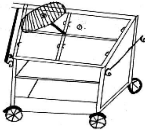
SALAD FRUIT TROLLEY